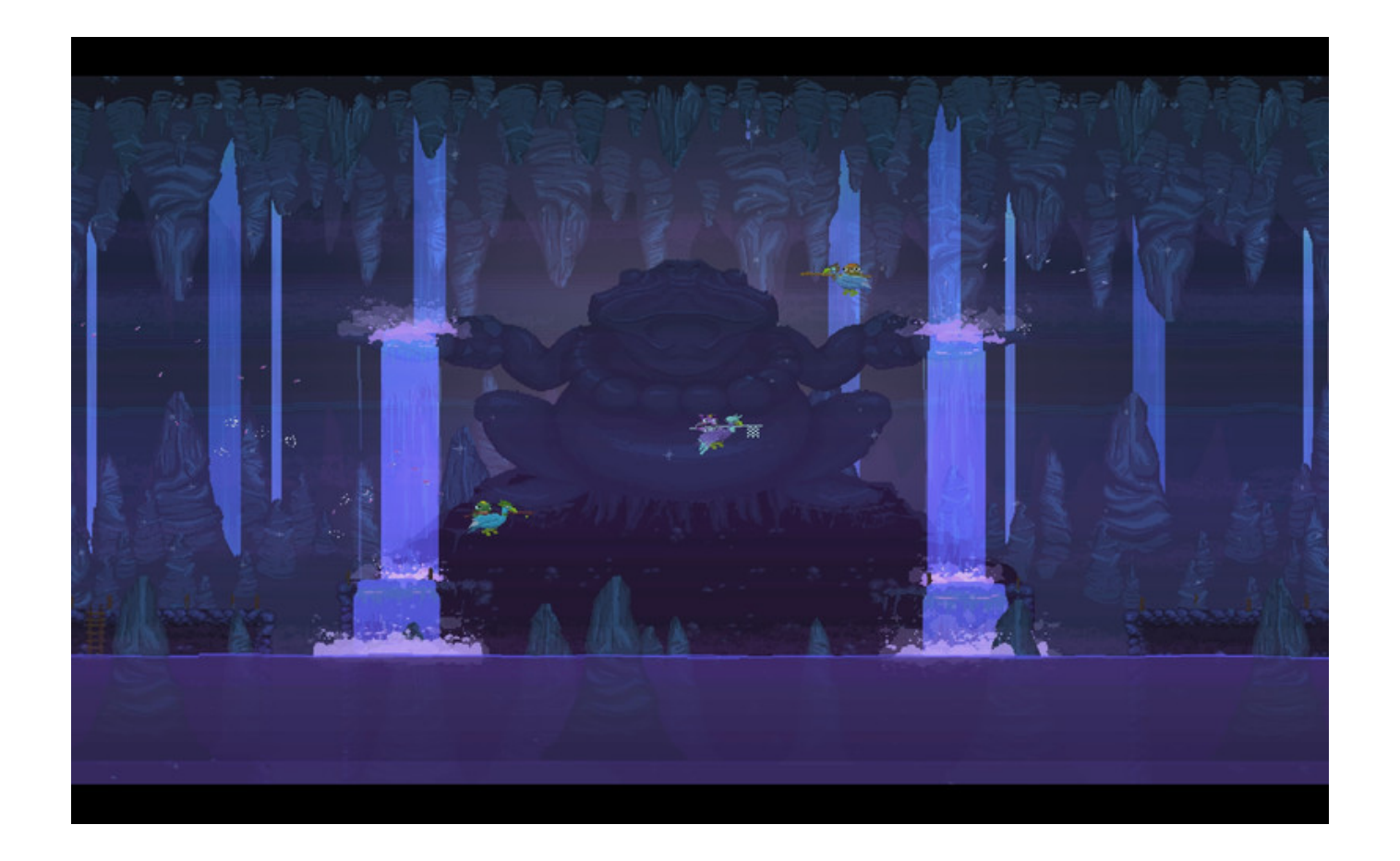
D'LIRIUM: The Golden Rogue Free Download [addons]

Download ->>> <a href="http://bit.ly/2SOjVD5">http://bit.ly/2SOjVD5</a>